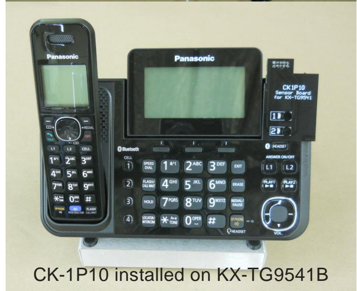
CK-1P10 installed on KX-TG9541B