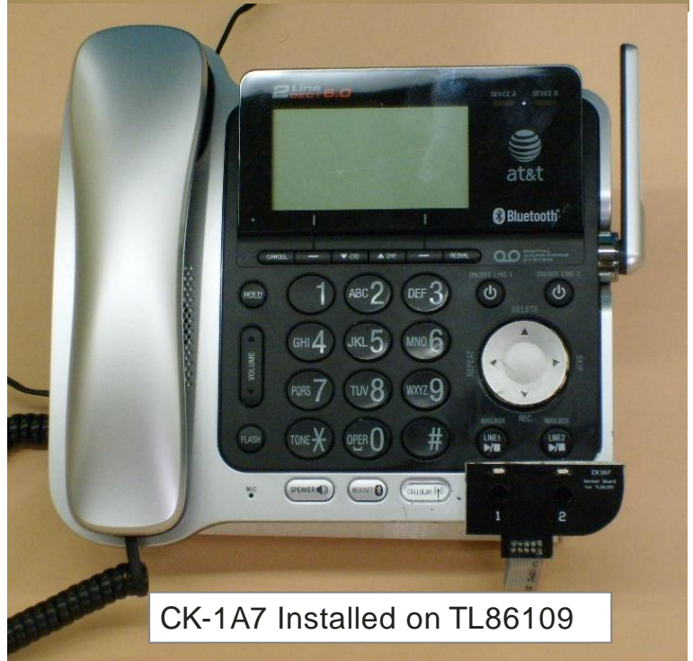
CK-1A7 Installed on TL86109